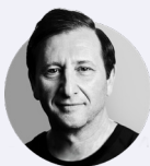
ALEX MASHINSKY FOUNDER OF CELSIUS NETWORK , VENTURE INVESTOR, SERIAL ENTREPRENEUR, TECH INNOVATOR